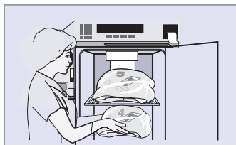
Load bag in sterilizer and activate cartridge.