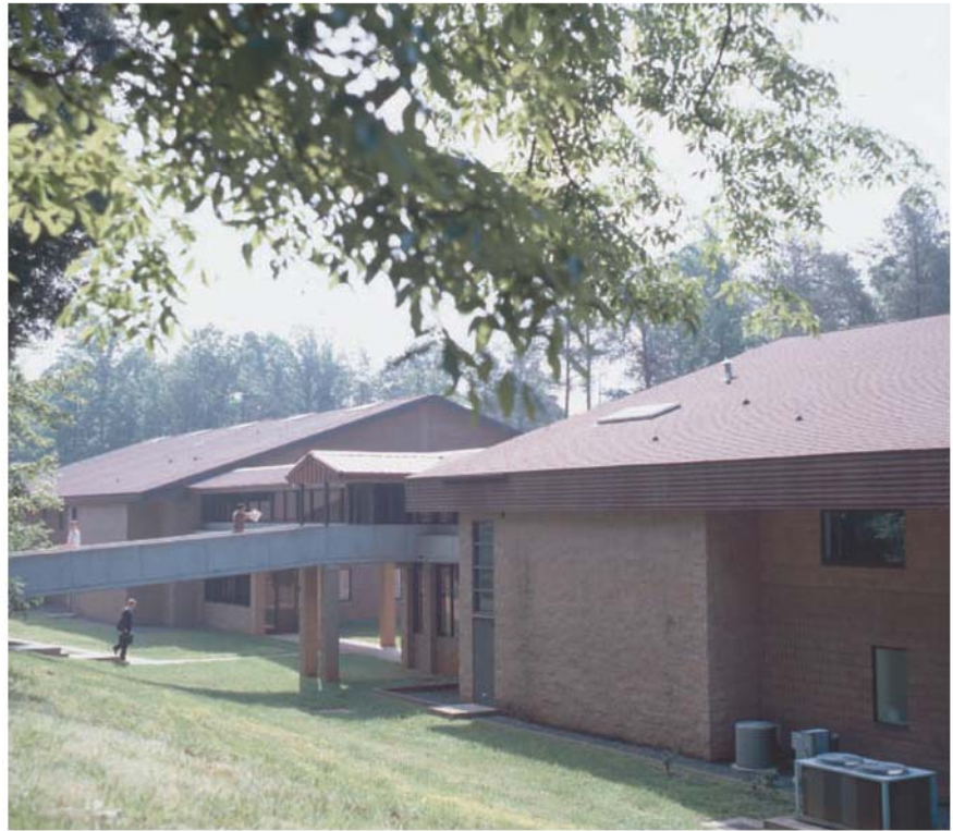
Health Science Park, Haw River, NC

Andersen Products has been in the gas sterilization business for over three decades. Our sterilizers are the most technically advanced on the market with a proven track record for reliability and effectiveness.